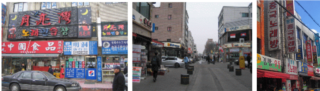
Figure. 10 Signscape of Ansan Street

Because of the extreme mixture caused by noticeability competition of the signboard and the stereotyped signboard arrangement plan, existing signboard scenery and newly formed signboard scenery are extremely put in disorder on Signscape of the foreigner's village at Ansan.