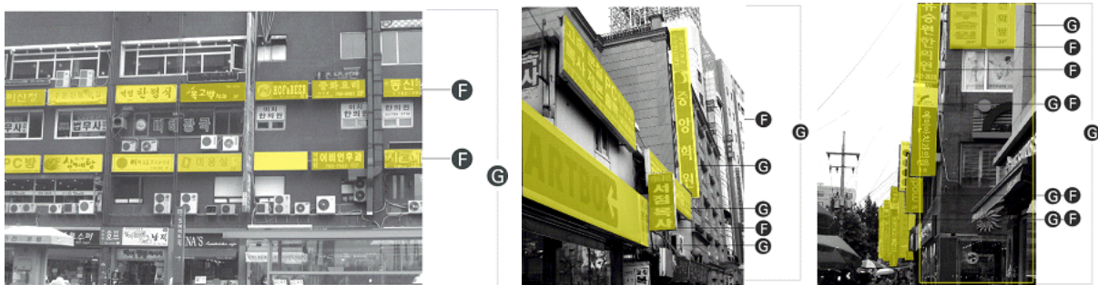
Figure.5 ‘ Figure and Ground’ appearance in Signscape

mixture each of information. Each signboard uses more stimulative color or chooses exclusive size in order to get the noticeability of information.