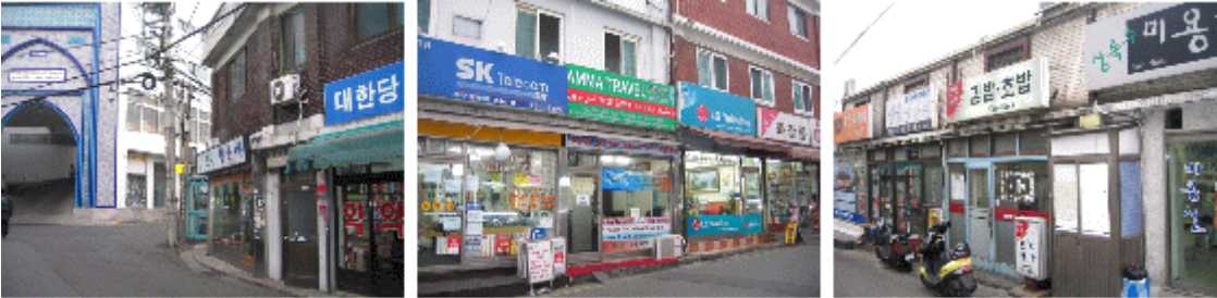
Figure.7 Signscape of Itaewon street

The aggregated commercial area of Itaewon in Seoul is the street of old city developed relatively long ago and each signboard has been made and changed continuously by commercial basis and pedestrian's characteristics of this place, these aspects has been settled as a inimitable visual identity.