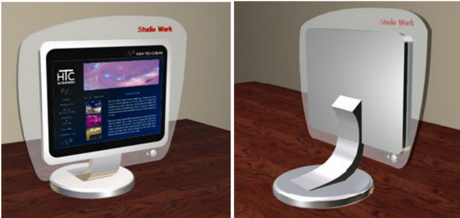
Figure.4 Casual Monitor

Another monitor was designed as casual monitor (Figure 4).