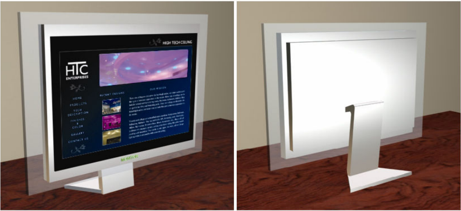
Figure.3 Formal Monitor

Based on the analyzed data (Table 2), two monitors were designed. In the design process visual elements and specifications were applied, so two different monitors with different characteristics were designed. One of the monitors was designed as a formal characteristic. The word formal was linked to specific physical properties which were concluded from the study (Figure 3).