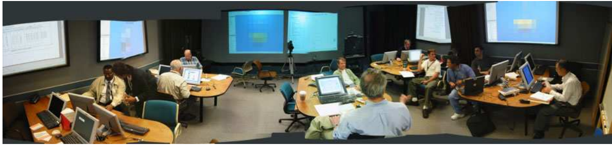
Figure 1. The NPDT in Action at JPL. Team leader and customer seated at central table with domain experts around perimeter; remote participants join via conference phone (central table) and screen-sharing application.

2 —with the balance devoted to fully-funded projects in advanced stages of development, launch or operation. The result of these teams' efforts (approximately 9 3-hour sessions over a 3-4 week period) are highly-detailed technical proposals which, to the extent they compete successfully in NASA's funding environment, ensure a continued flow of work to sustain the lab as a whole. Though the intense atmosphere of the warroom is not for everyone, membership on these teams conveys benefits to participants as well. These include a certain prestige and visibility for skills and expertise which, to the extent their contributions are valuable, make participants more likely to be offered work on funded projects as they go forward. The practice allows a small group of champions pursuing an idea to be augmented in concentrated, targeted doses with a deep pool of knowledge, experience and specialized technical expertise, without burdening early-stage projects with large headcounts. By leveraging skills and building a strong core of expertise to execute projects quickly, at the same time preserving the ability to have many lightly-staffed exploratory efforts, JPL's practice is a novel and effective response to the dilemma organizations face in allocating resources between exploration and exploitation activities [15].