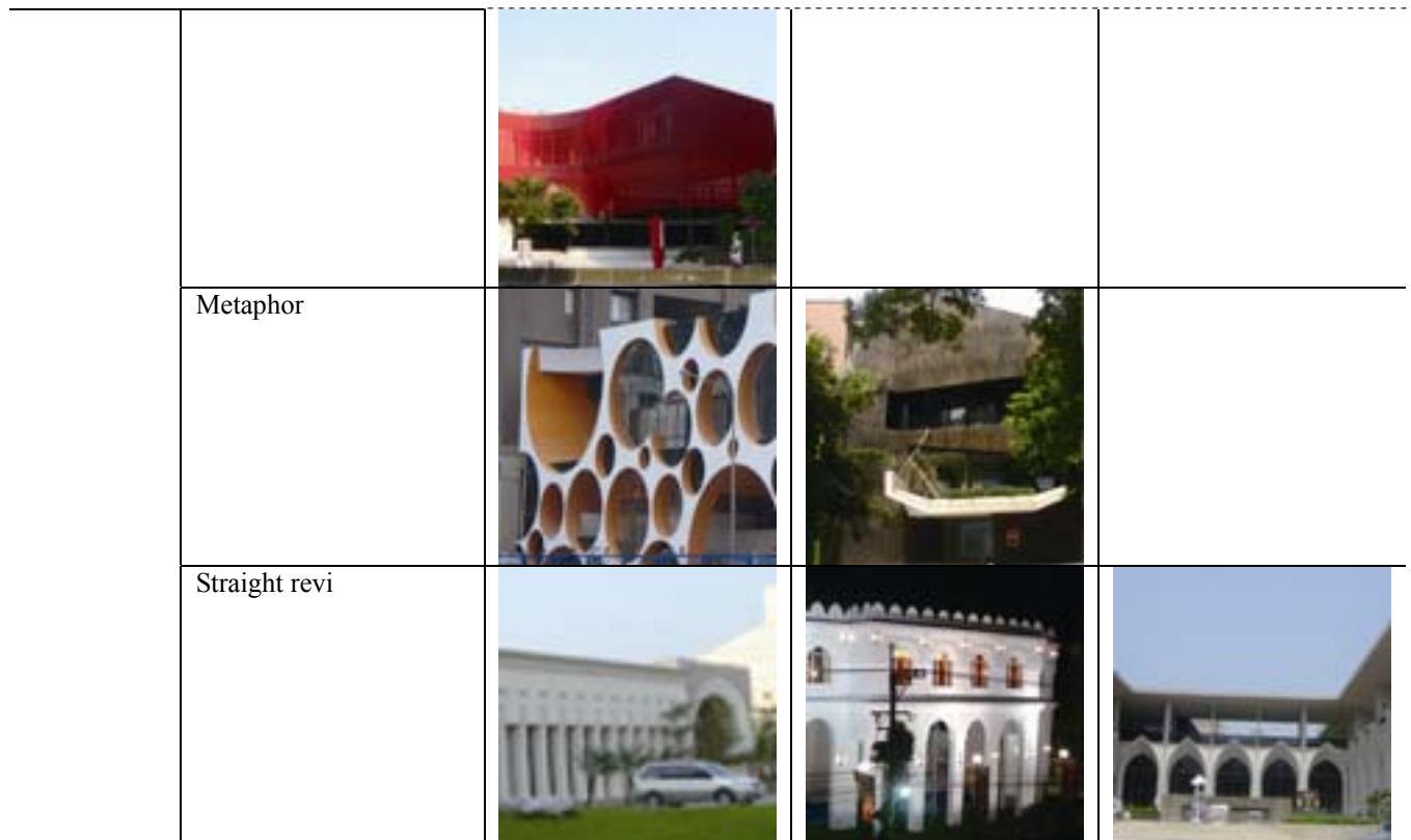
Figure.2 Style Study