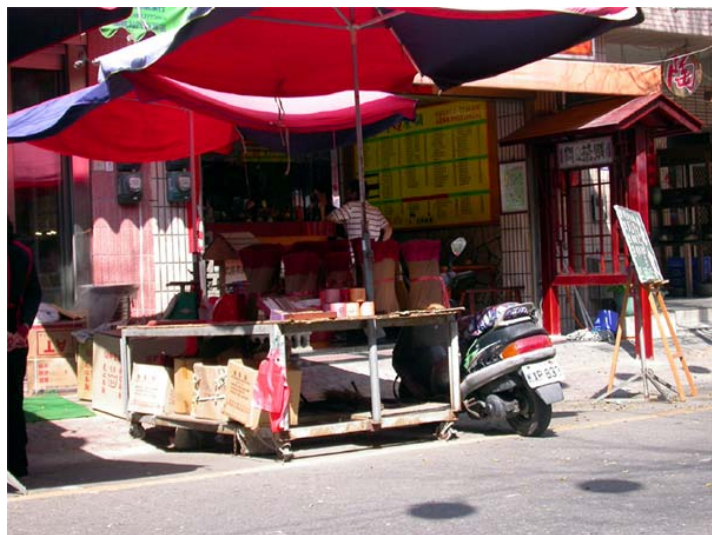
Fig. 2 Incense selling in the street

The traditional incense stores in Taiwan can be divided into two categories: specialty stores and grocery stores. Specialty stores are those that sell only the candles and printed money for ancestor-worship, whereas grocery stores sell different types of household items with a few selections of wares for ancestor-worship. Incense stores vary in their scales, and incense is also sold by mobile vendors or household shops. This makes the incense market more complex and thus incense shops can be seen virtually anywhere (Fig. 2).