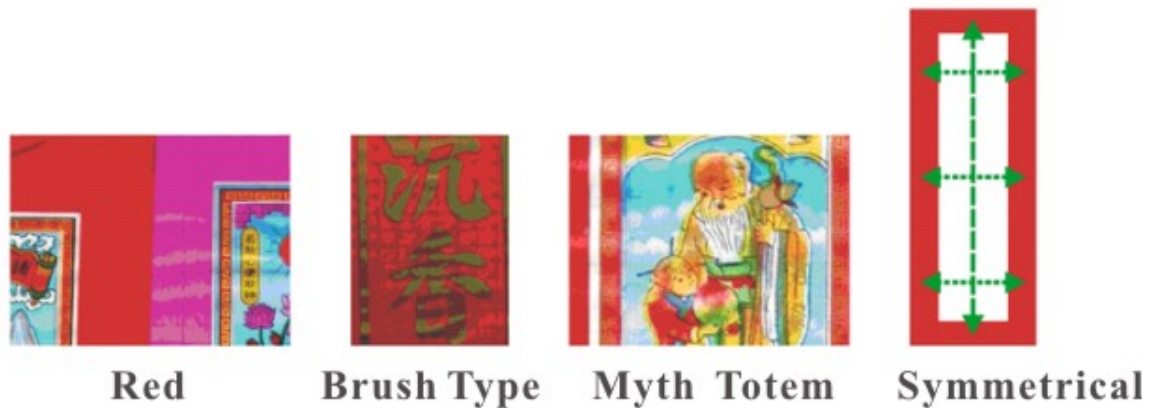
Fig. 5 Packaging design structure of incense

fortune include red, orange, yellow, purple, and gold, with red being most popular as it also means "being blessed and avoiding misfortune." Gilding is also commonly seen on incense packages for the purpose of giving the product an ornate and elegant look.