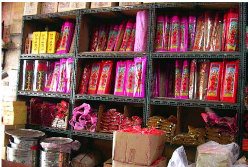
Fig. 3 Tian-Faug Shei, incense store in the city of Taichung County, Taiwan

The reason why traditional incense stores can be seen everywhere is because it is easy to start one. Many business owners believe that this kind of business will always be profitable since incense is "inexpensive" and "essential" in people's lives. Given these two conditions (convenience and demand), it is not difficult to see why such stores are everywhere. People often perceive old incense shops as dusty, cramped, and dark. Today, however,