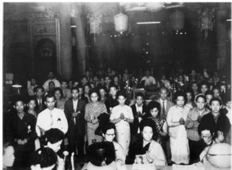
Fig. 1 Ceremony in Lukang's Tianhou temple, Taiwan (1945)