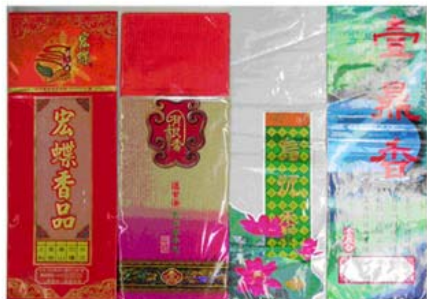
Fig. 7 Different visual design in the form of traditional incense bags

The designers who work on incense packaging stated that clients' needs are still the most important basis for a design, and a further examination of the traditional "pattern" of incense packaging indicates it is the most common design in today's incense products. Therefore, follow-up designers still need to look up these visual images, situations, and layout when dealing with designs and layouts and gather and re-arrange certain elements in order to achieve "innovation" with the restrictions. A few modern incense products have also been utilizing different elements of design. For example, Fig. 7 shows a pattern that is quite different from that of the traditional packaging. This also indicates that with the simplified culture of ancestor-worship and incense applications and modern aroma products, the design of traditional incense packaging is showing changes for the purpose of improving product image and exposure (such as agar wood and sandalwood). However, the design of incense packaging is not only based on a client's needs and existing patterns, but the image of incense (smoke), context (ceremonies of ancestor-worship), and cultural background (Chinese style) are also being considered in the modern design of incense