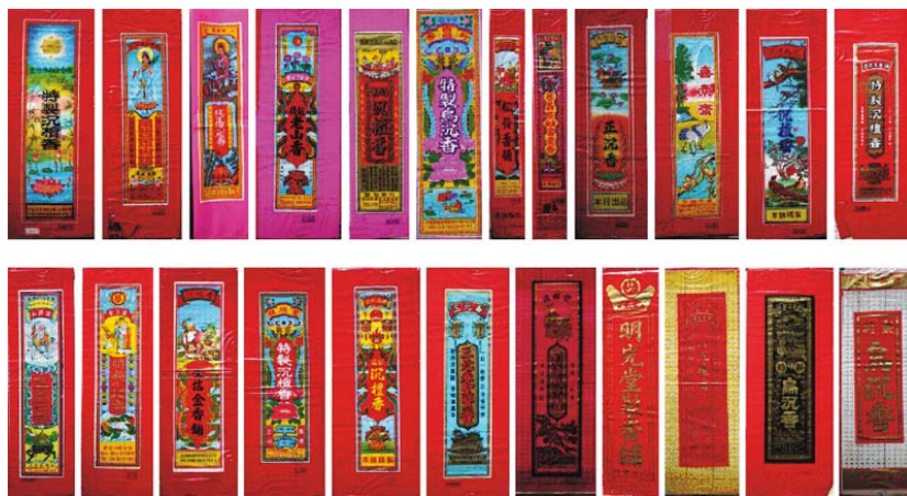
Fig. 4 Bags of incense

purchasing incense for ancestor-worship, consumers intuitively recognize something as a product for this purchase when seeing the similar style of packaging. They would purchase and use it without carefully examine or choose this kind of products. This kind of design of packaging that has been used for years has not only indirectly further defined the market of