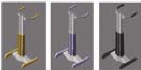
Figure No. 1

In third step according to the product domain many concepts were generated. Due to the design limitations such as users' ability and technical considerations ten concepts have been selected. Four concepts, which could be appropriate representative for all concepts, were compiled. These four selected concepts were evaluated by Kansei Engineering method. This study was performed to decide regarding the visual specifications of the product. Therefore, it carried out via two dimension pictures. Fifty two people, 23 men and 29 women between 55-82 years old were selected randomly. Four concepts with final Kansei words were studied to investigate the visual properties of final product. All four concepts were developed in three different colors, including yellow-orange, blue-purple and dark gray on an A3 paper. All concepts were presented in isometric perspective on a mild gray background (Figures no.1 to 4).