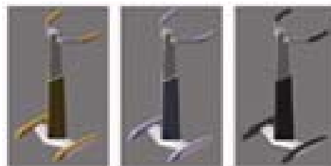
Figure No. 2